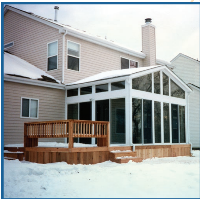
Above: This glass enclosure demonstrates the energy efficiency of the Snap-N-Lock™ Roof system.

With the addition of our Snap-N-Lock™ Roof System, you could be enjoying your new enclosure in a couple of days!