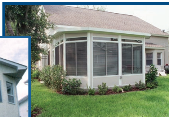
Above: Room layouts do not have to be rectangular. Design the room to suit your taste.