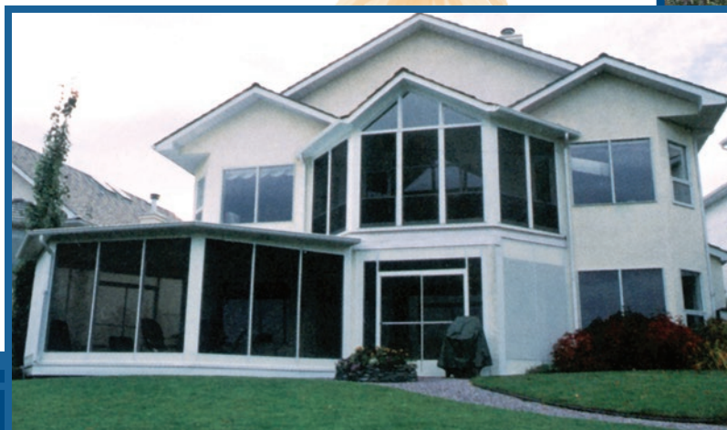
Right: This two level enclosure features a screen room on the lower level and vinyl 4-track windows and trapezoids on the upper level.